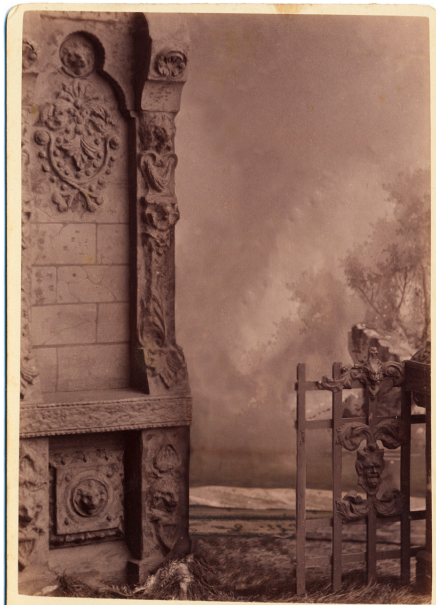
HARTLEY'S STUDIOS CHICAGO.