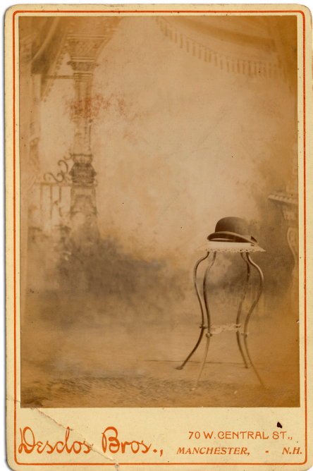
Desolus Bros., 70 W. CENTRAL ST., MANCHESTER, - N.H.