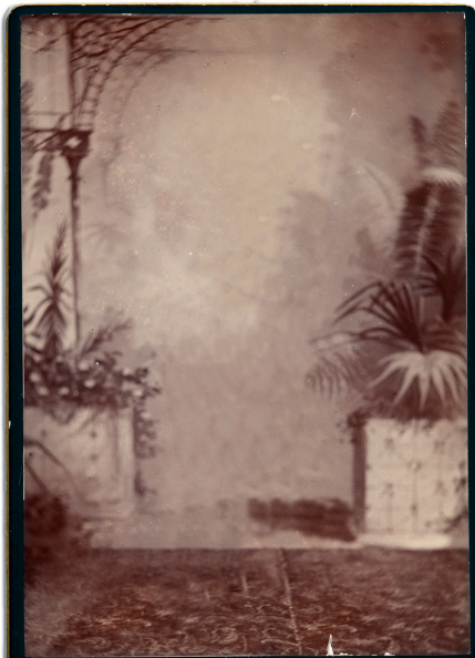
Phillips & Froehle, CHAPEL BAR NOTTINGHAM.