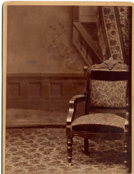
Nottingham, Mason City, Mass.